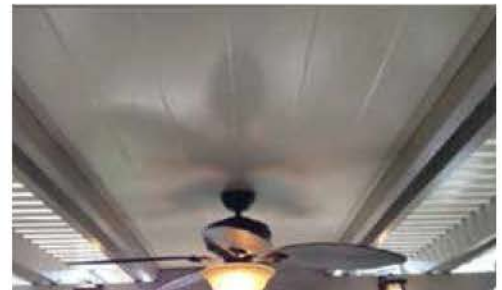
OPTIONAL PLANKING FEATURE.

Elitewood™'s insulated patio covers come with a limited lifetime warranty. Enjoy your new outdoor retreat, not worry about it.